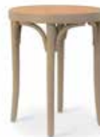
DIÖ stool/table Gemla Archives 1926