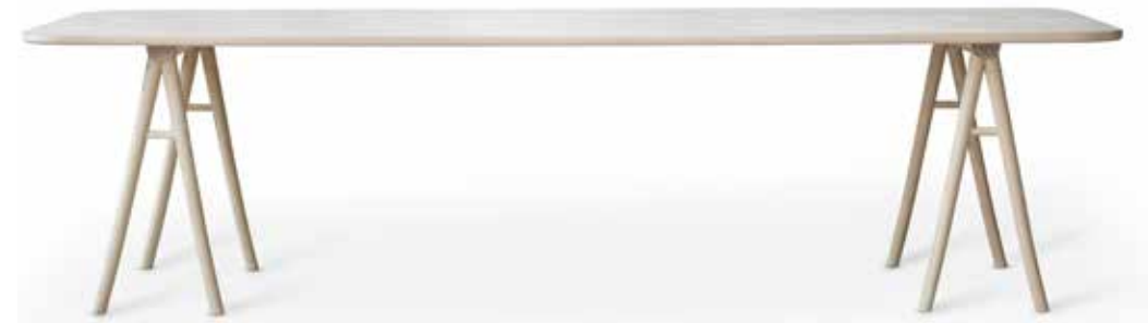
COLLAGE table Front 2015