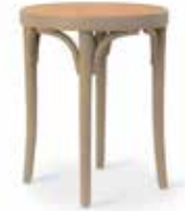
DIÖ stool/table Gemla Archives 1926