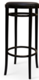
JOSEFIN Gemla Archives 1990