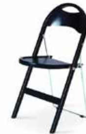
BERN Gemla Archives (updated by Uno Åhren) 1928