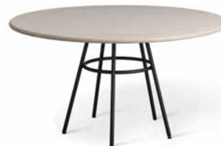
BOCK dining table Jonas Bohlin 2000