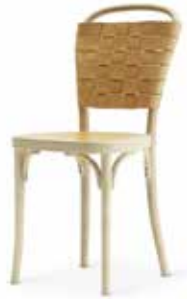
VILDA 5 Jonas Bohlin 2011