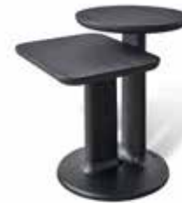
STAM side table duo Sami Kallio 2022