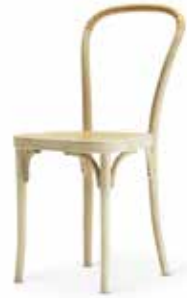
VILDA 2 Jonas Bohlin 2011