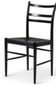
GRACELL Yngve Ekström 1956