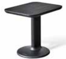
STAM side table rectangular Sami Kallio 2022