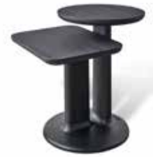
STAM sidetable Duo Sami Kallio 2022