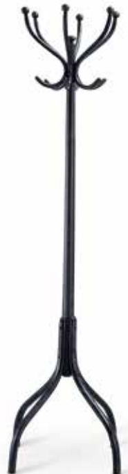
STÅNGEN Gemla Archives 1957