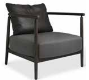
HUMBLE Pierre Sindre 2020