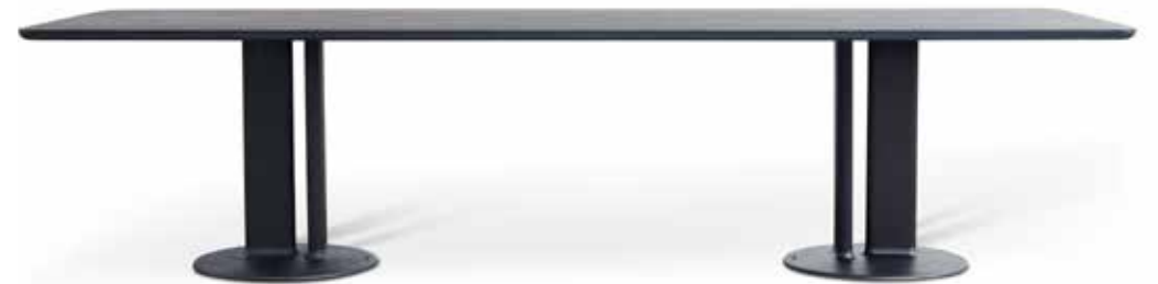
STAM various sizes Sami Kallo 2022