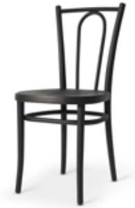
LYON Gemla Archives 1910