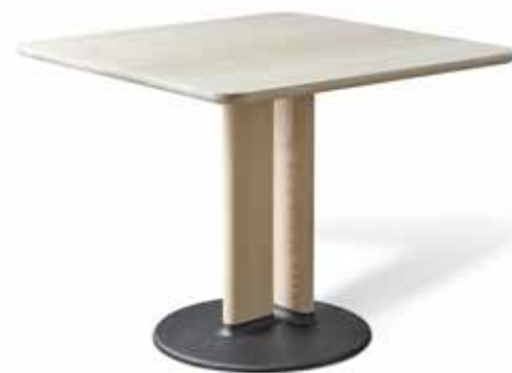
STAM dining table 90x90 cm Sami Kallio 2022