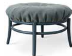
HOLME pouf Mia Cullin 2023