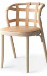
COLLAGE Front 2013