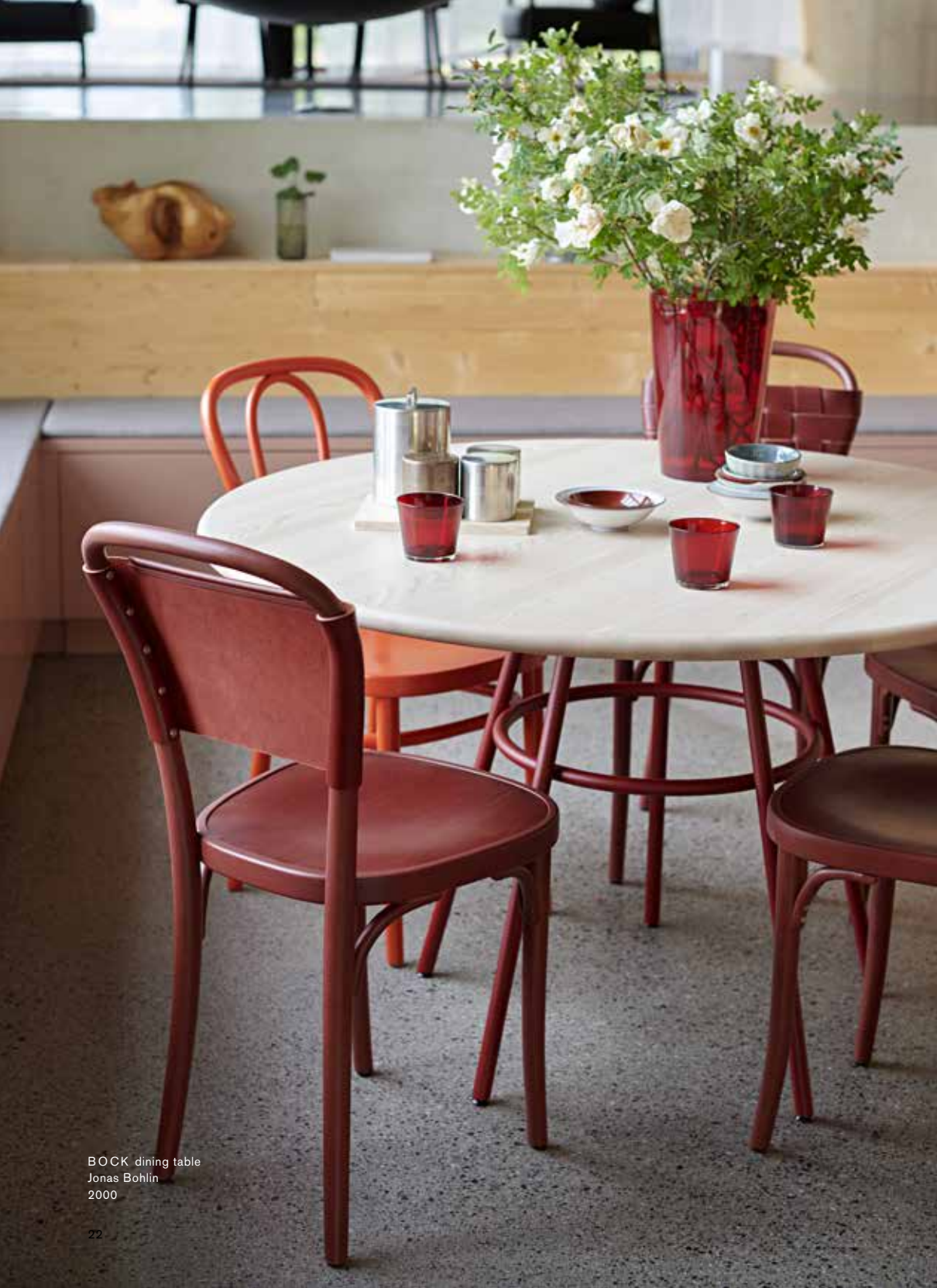
BOCK dining table Jonas Bohlin 2000