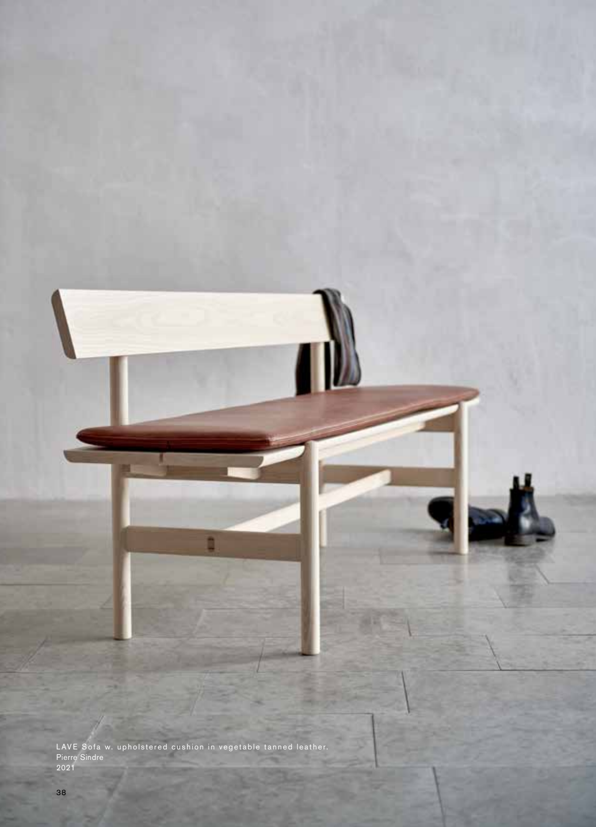
LAVE Sofa w. upholstered cushion in vegetable tanned leather. Pierre Sindre 2021