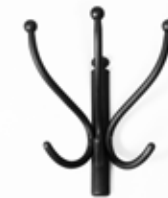
KROKEN Gemla Archives 1961