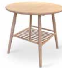
SOLFJÄDERN table Gemla Archives 1970