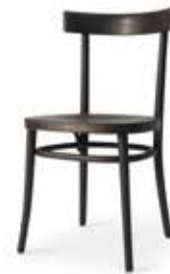
DONAU Gemla Archives (updated by Uno Åhren) 1930