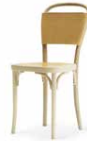
VILDA 3 Jonas Bohlin 2011