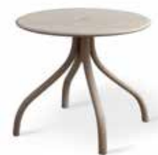
KILEN Mia Cullin 2020