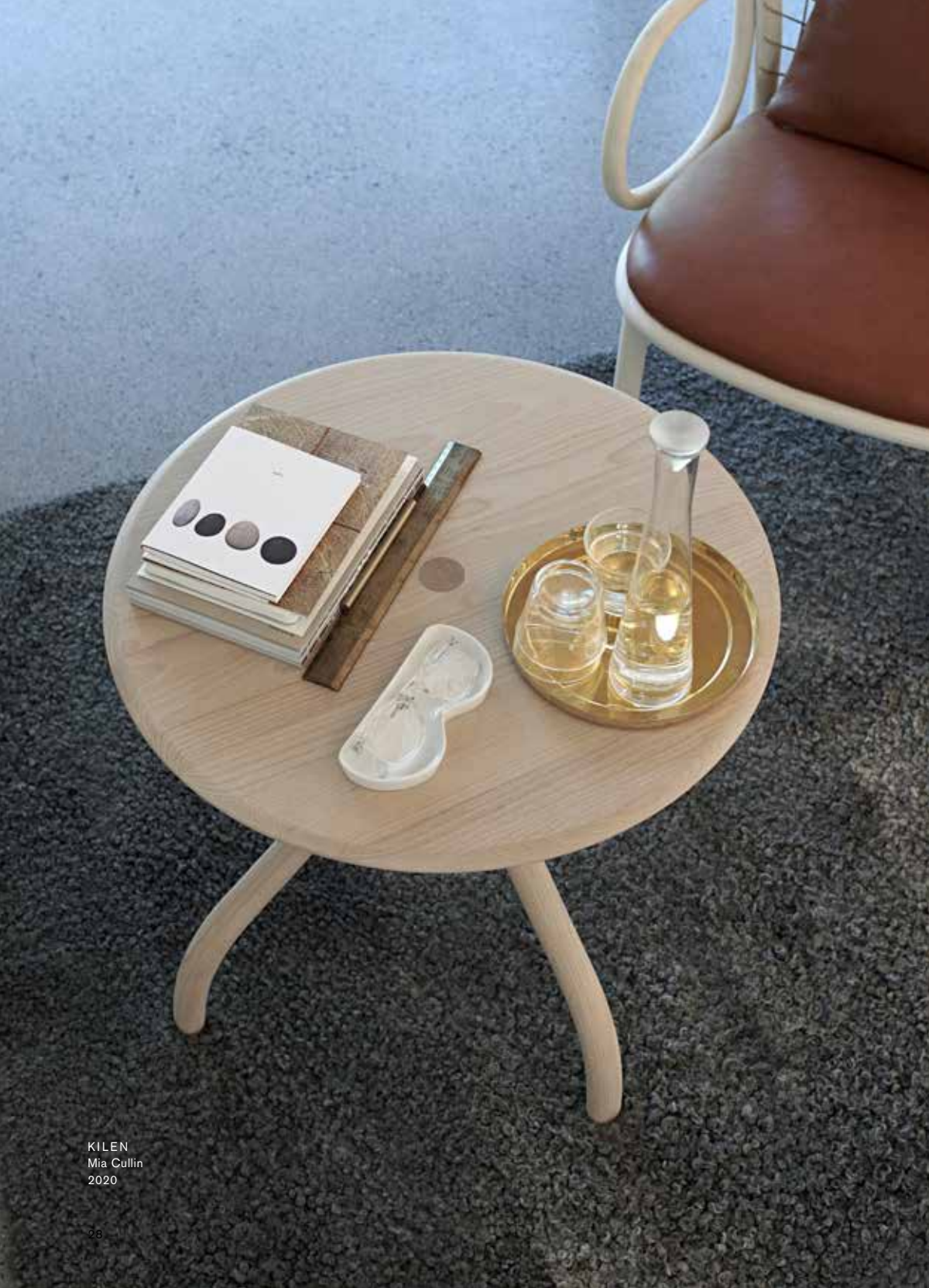
KILEN Mia Cullin 2020