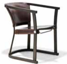
T13 Mats Theselius 2013