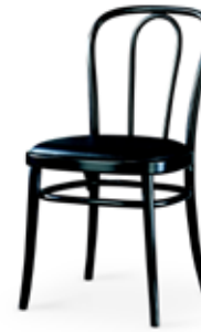
WIEN Gemla Archives 1907