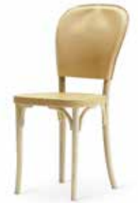
VILDA 4 Jonas Bohlin 2011