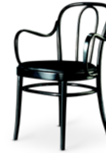
WIEN Gemla Archives 1907