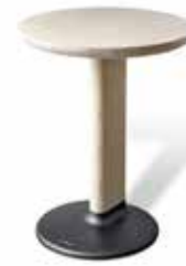
STAM sidetable tall Sami Kallio 2022