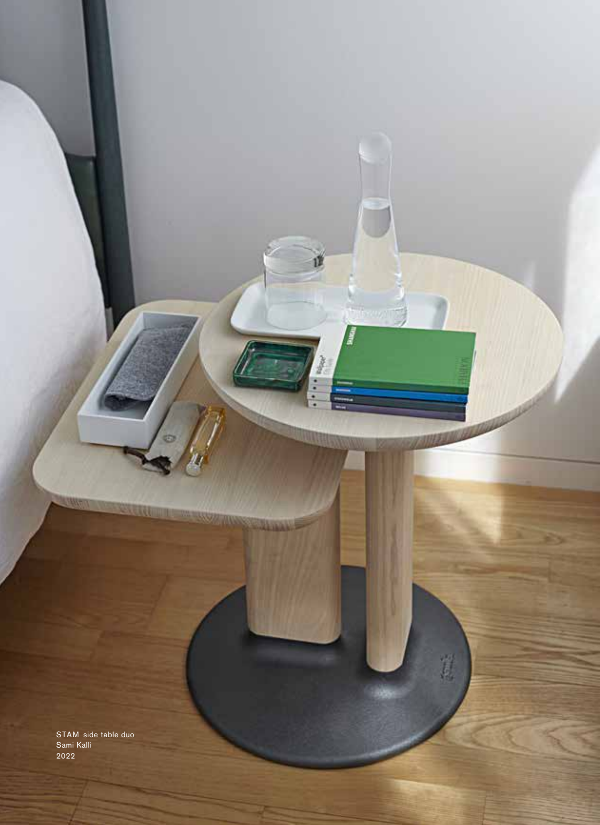
STAM side table duo Sami Kalli 2022