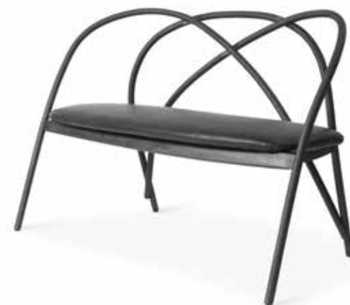
BOW 17 sofa Lisa Hilland 2017