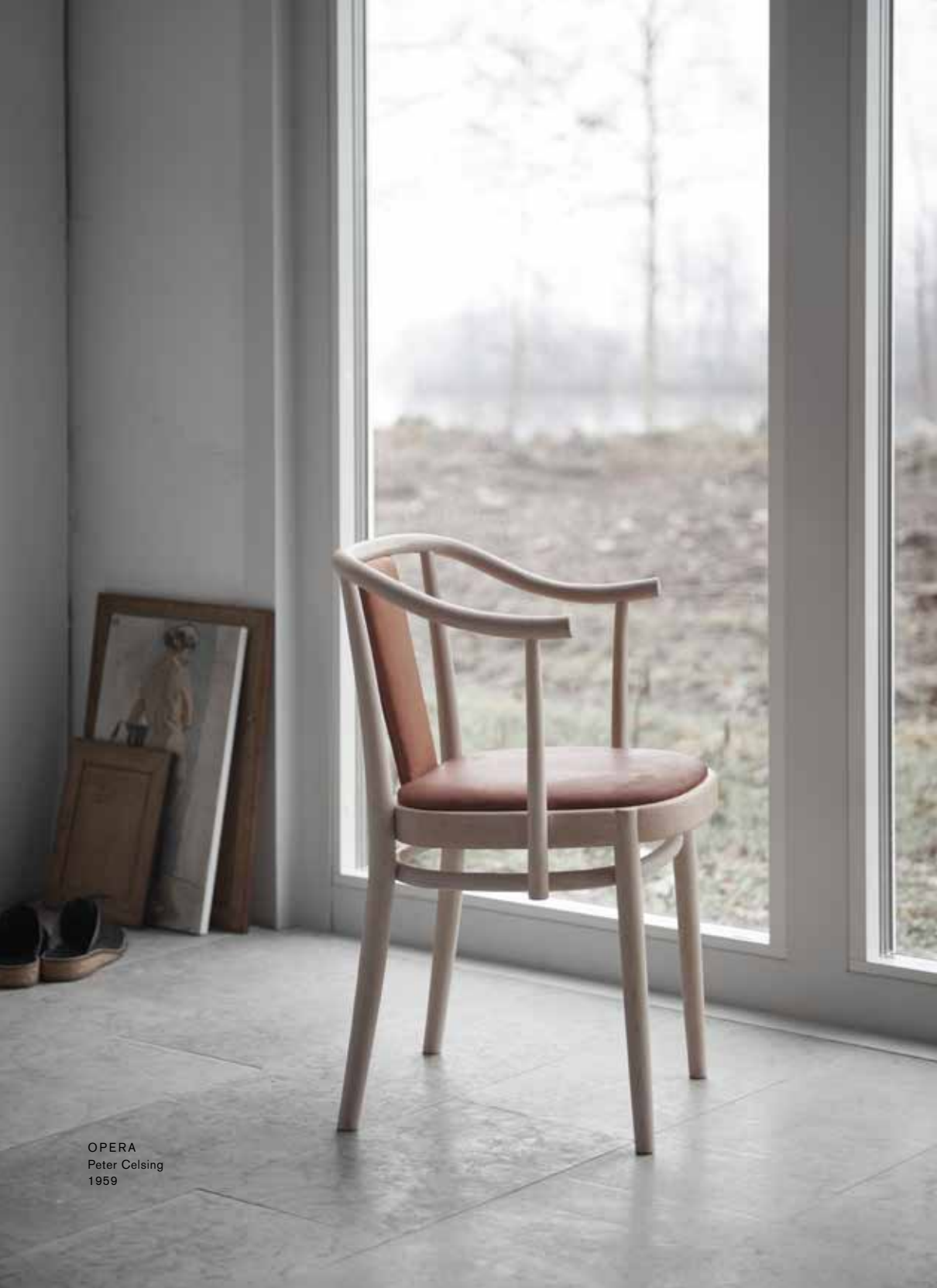
OPERA Peter Celsing 1959