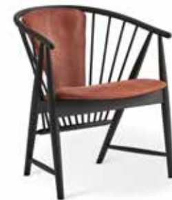
SOLFJÄDERN leather back Sonna Rosen 1948