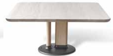
STAM coffee table 90x90 cm Sami Kallio 2022