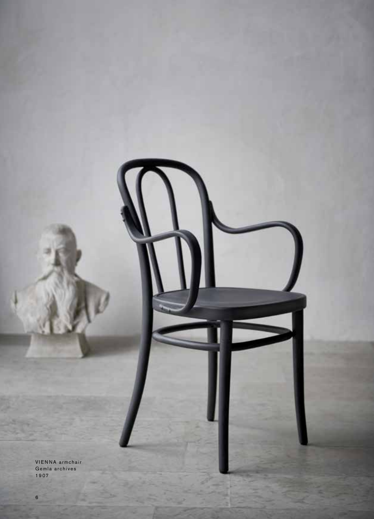
VIENNA armchair Gemla archives 1907