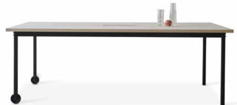
STILLA various sizes Jonas Bohlin 2015