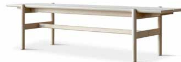
LAVE bench Pierre Sindre 2021