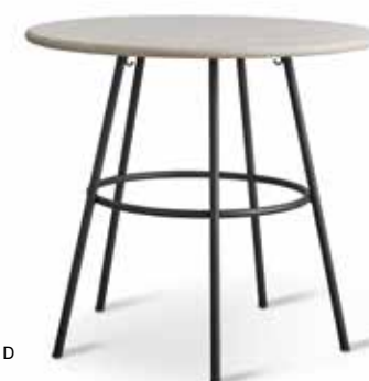
BOCK BARBORD Jonas Bohlin 2000