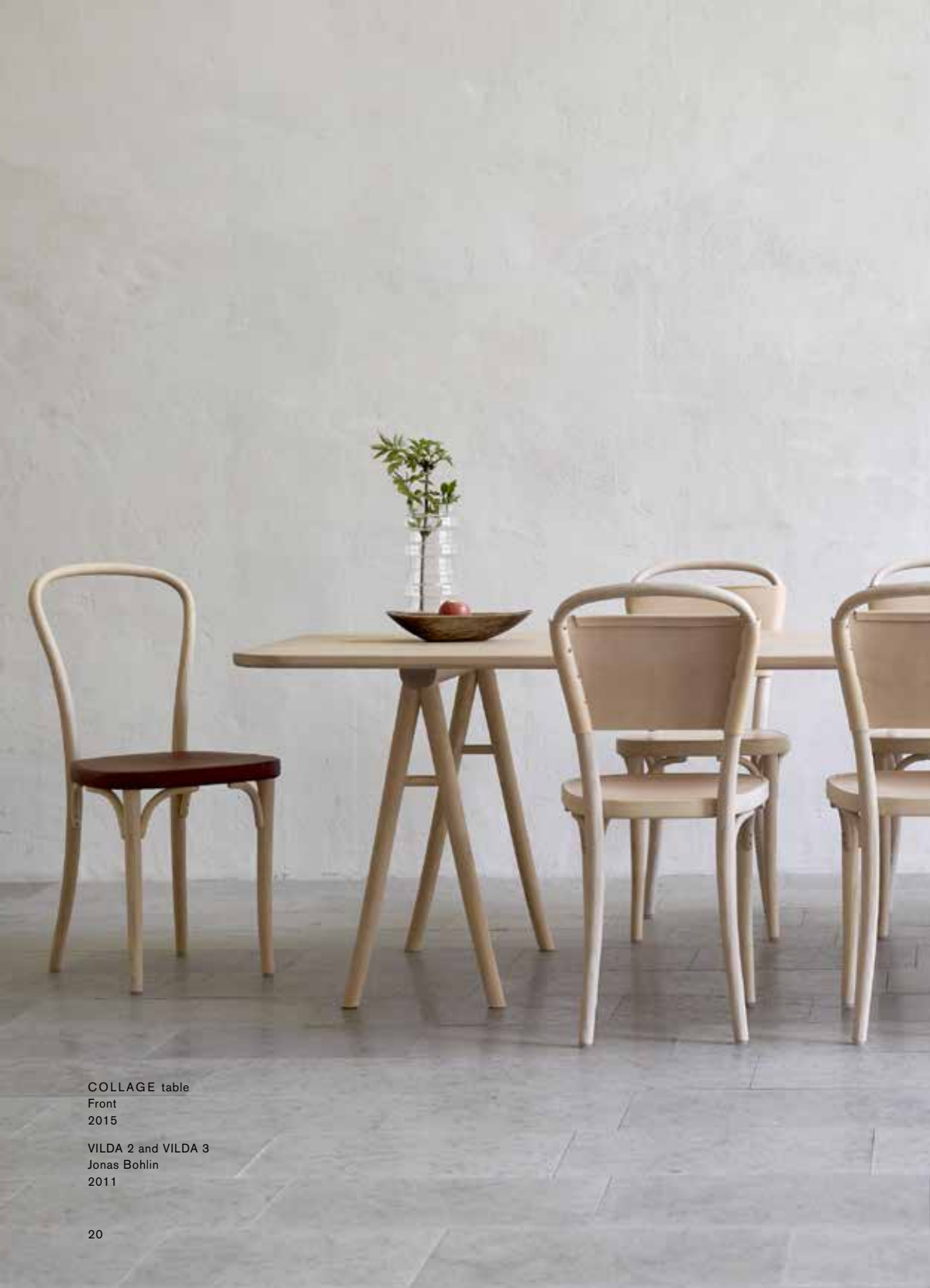
COLLAGE table Front 2015