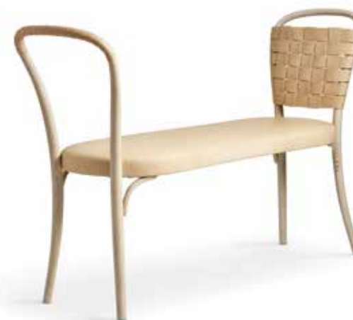
VILDA bench Jonas Bohlin 2012