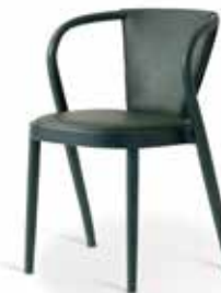
ROTUNDA upholstered back Jack Ränge 1959