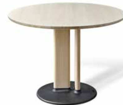
STAM dining table Ø 105 cm Sami Kallio 2022