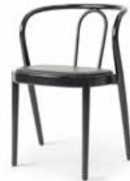
ROTUNDA Jack Ränge 1959