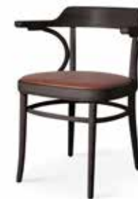
CATELIN Axel Kandell 1948