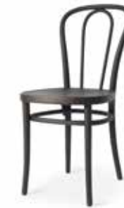
VIENNA Gemla Archives, 1907. One of our customers true favorites. A neat comfortable chair, made to last for generations.