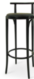
LINUS Åke Axelsson 1989