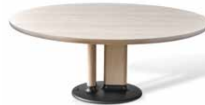
STAM coffee table Ø 105 cm Sami Kallio 2022