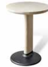
STAM sidetable low Sami Kallio 2022