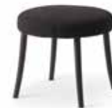
KOBBE Gemla Design 2018