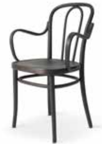
VIENNA armchair Gemla Archives 1907