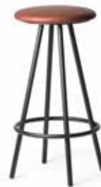
HOF bar stool Jonas Bohlin 2002